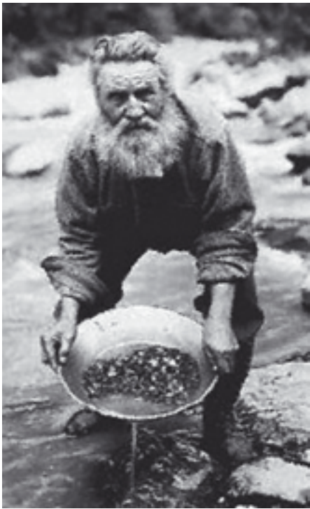
Panning for ideas: Networking events come up with nuggets to share